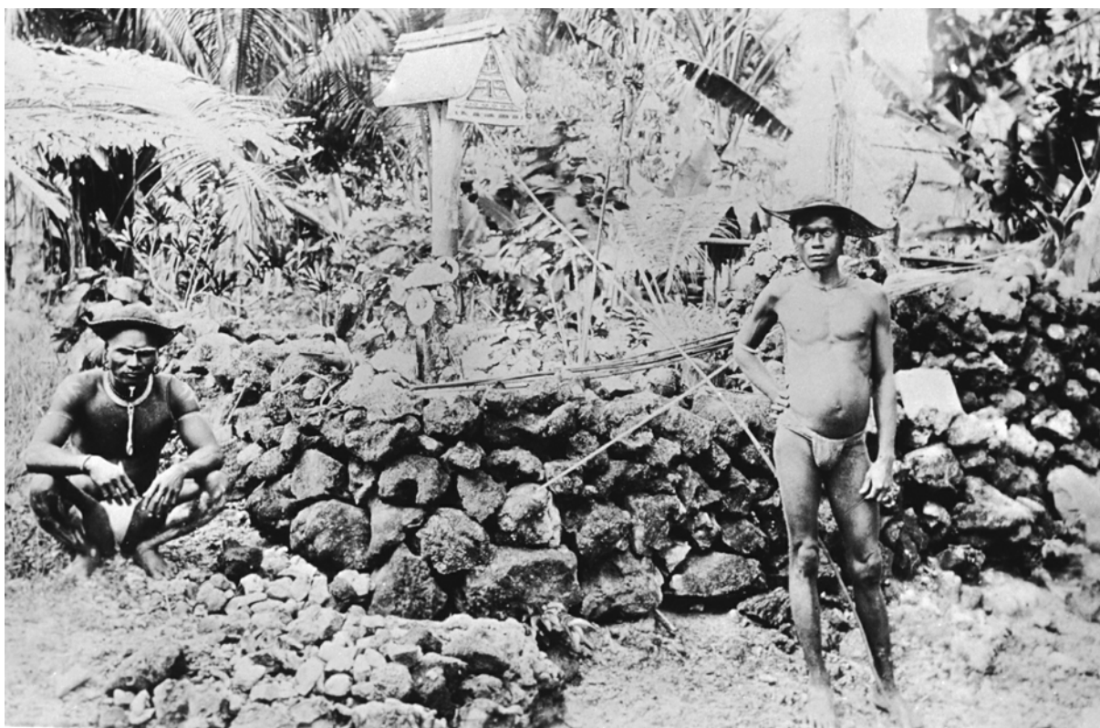
Fig. 2. Shrine ( hope ) in Roviana c. A.D. 1900 (Courtesy the Methodist Archives Auckland).

When asked about shrines people clearly distinguish between shrines for which they have traditions and affiliation, and those for which they don't. On the island of Nusa Roviana, which was the nineteenth century centre of the Roviana polity, people have traditions about the