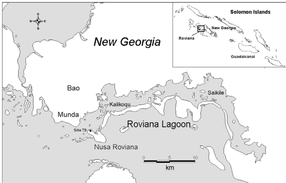
Fig. 1. General location map.